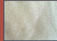
Sugar IC 45